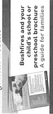
Bushfires and your child's school or preschool brochure A guide for families