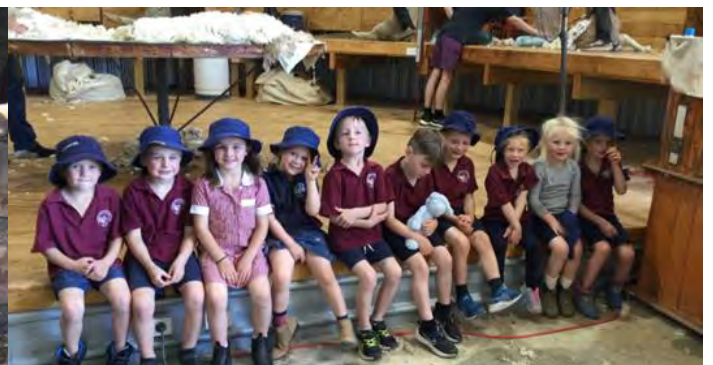
The Kindy Team