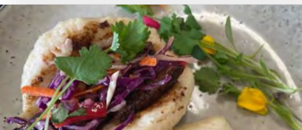
BCDS Year 12 Food & Hospitality HOMEMADE BAO BUNS WITH STICKY CHICKEN & ASIAN SLAW