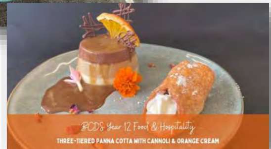
BCDS Year 12 Food & Hospitality THREE-TIERED PANNA COTTA WITH CANNOLI & ORANGE CREAM