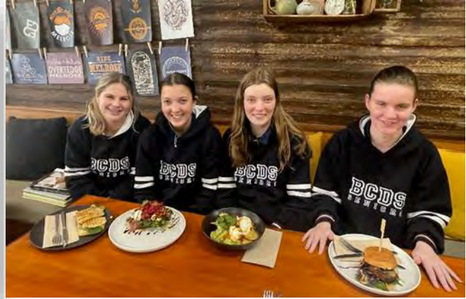
Over the Edge, Melrose