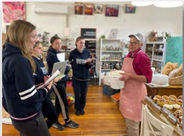
Black Rock Kitchen, Orroroo