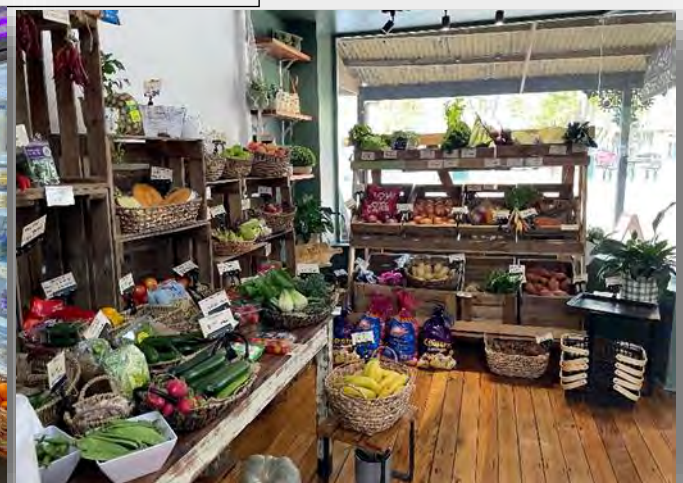
Two Farmers Daughters, Orroroo