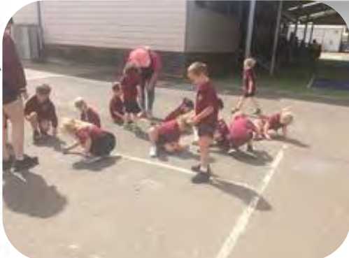
Positive affirmations written in chalk by the Kindy and R/1 students.