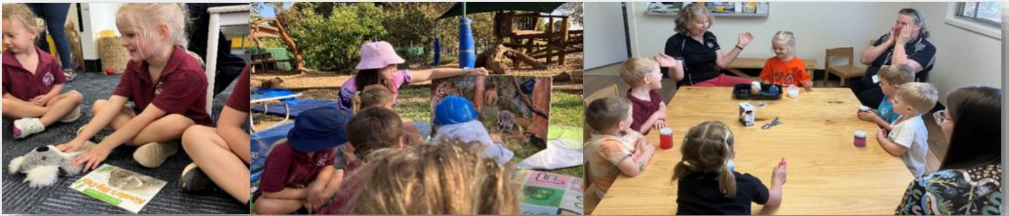
The Kindy Team